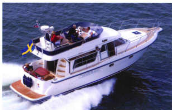
STOREBRO 410 COMMANDER