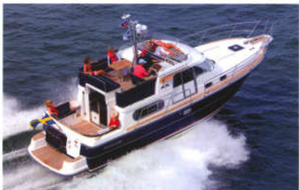
NIMBUS 380 COMMANDER