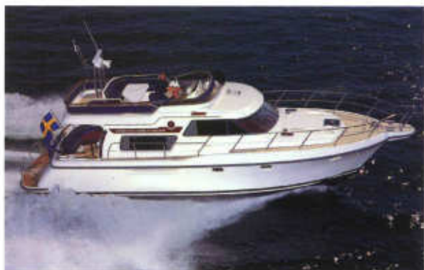
STOREBRO 475 COMMANDER