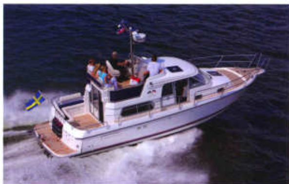
NIMBUS 340 COMMANDER