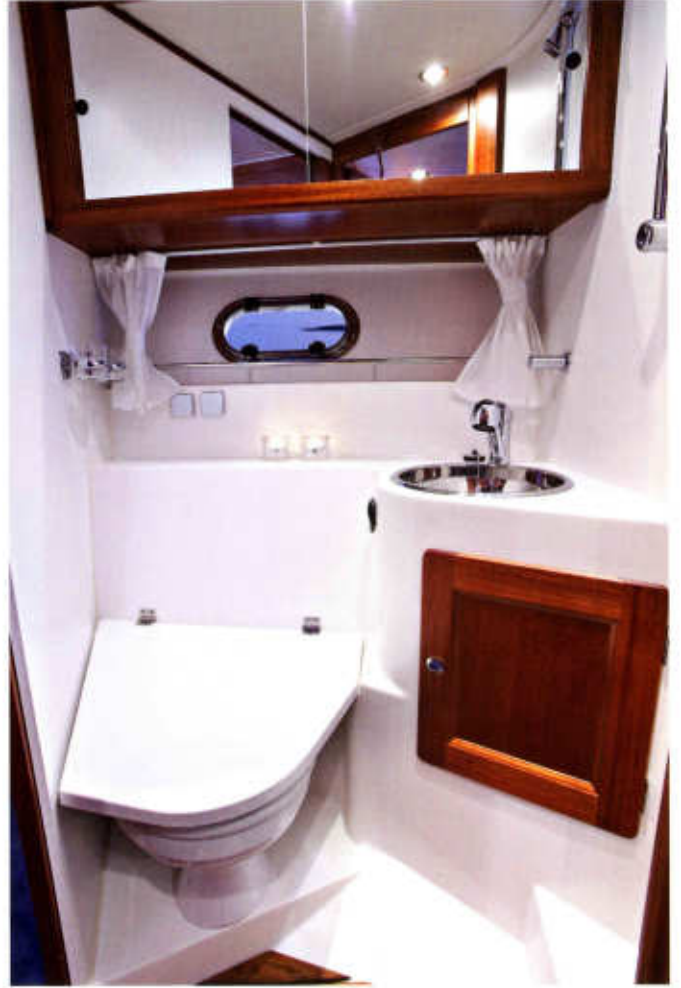
Port side shower and extra toilet in 3-cabin version