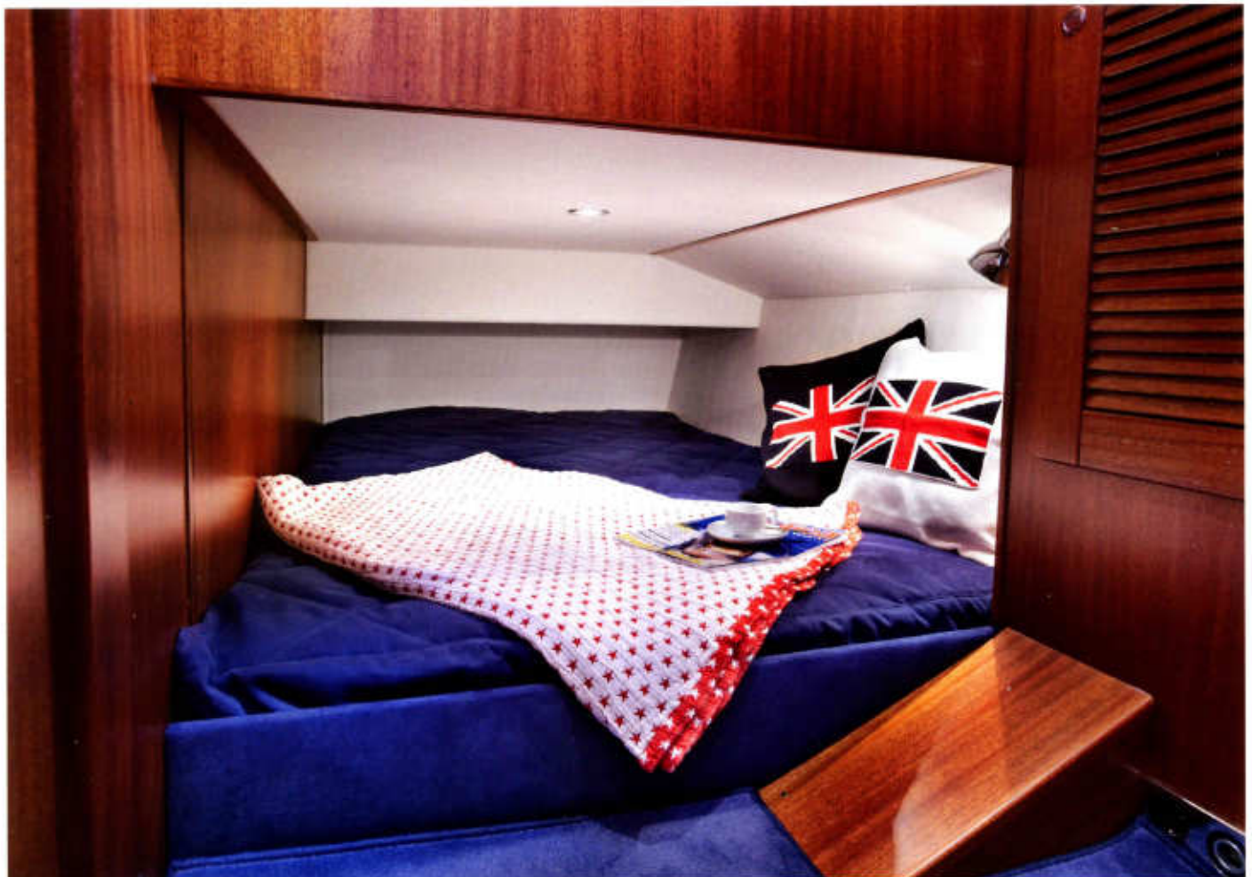
Extra guest cabin in 3-cabin version