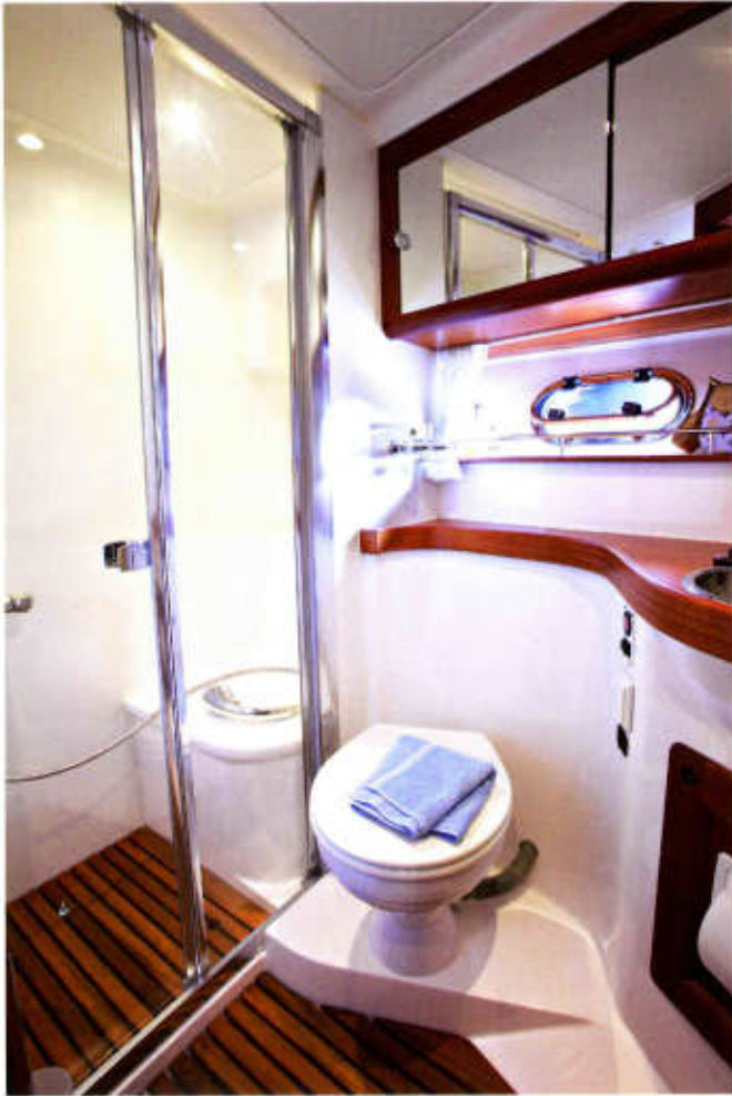
Port side owner's toilet and shower in 2-cabin version