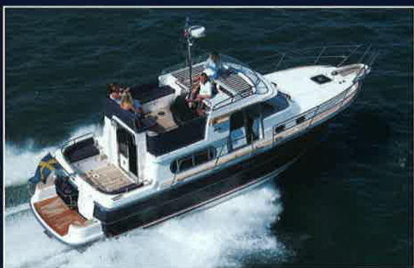
NIMBUS 380 COMMANDER