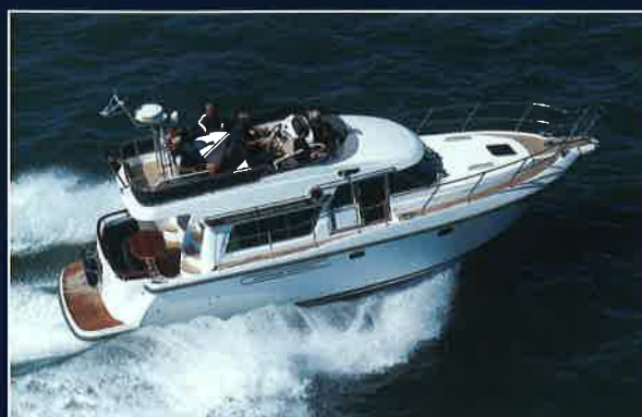
STOREBRO 410 COMMANDER