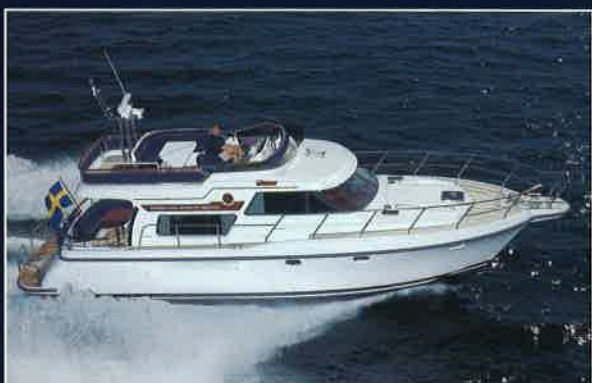
STOREBRO 475 COMMANDER