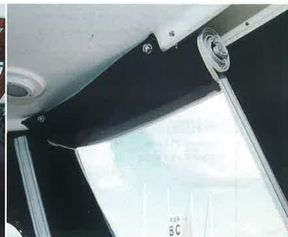
Far right: aft cockpit covers are superb – they roll up neatly into the flybridge overhang so that they don’t need to be fitted and stowed away each time.