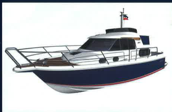
NIMBUS 340 COMMANDER