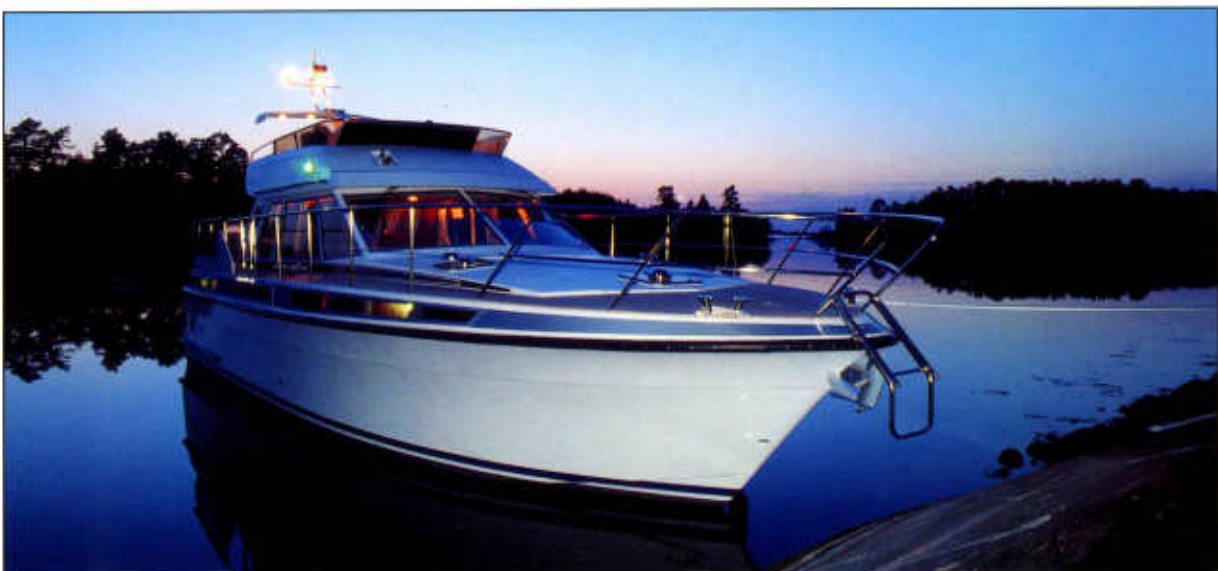
The Storebro Royal Cruiser 420 Baltic is one of a new generation of boats from Storebro. Its new design features include a deeper V-shaped hull, smoother, racier lines, an elegant gull-wing mast on the flying bridge and a reverse sheer stern.