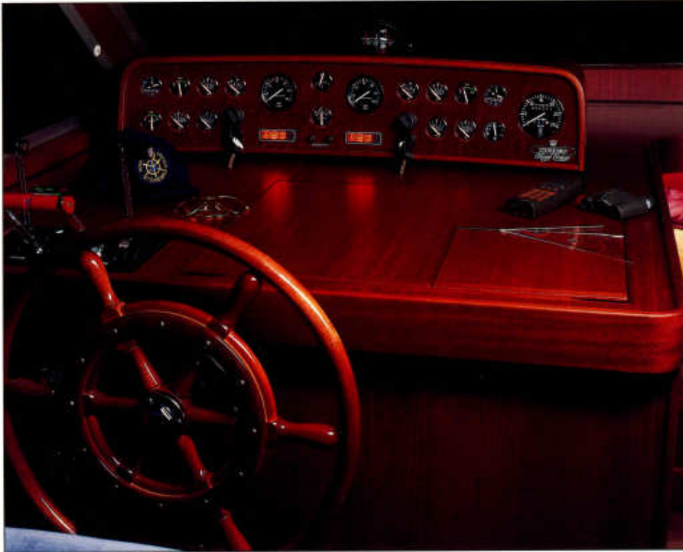
Exclusive woodwork is very much a hallmark of Storebro. The helmsman's position is typical, with handsome wood surrounds for the see-at-a-glance instruments and easy-to-hand controls.