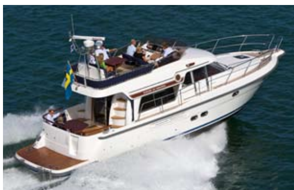
STOREBRO 435 COMMANDER