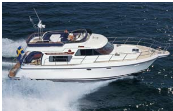
STOREBRO 475 COMMANDER