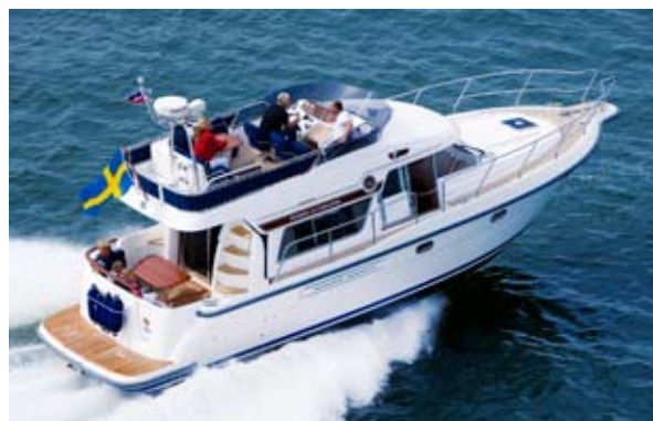
STOREBRO 410 COMMANDER