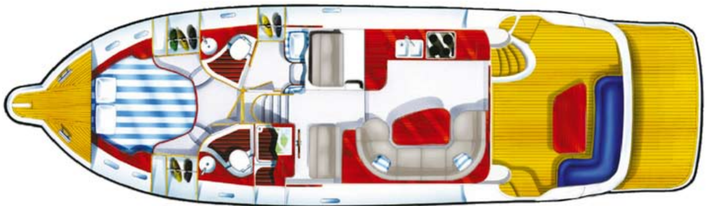
435 Commander 2-cabin version