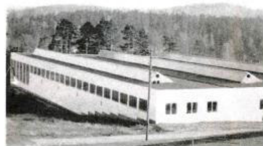
Welcome to Storebro to visit our boat yard.

LENGHT: 9.06 m. 29' 9" BEAM: 3.11 m. 10' DRAFT: 0.70 m. 2' 4" WEIGHT: 3,5 tons 3,5 tons FUELTANKS: 2 x 200 l. 2 x 44 gall WATERTANK: 125 l. 28 gall BERTHS: 4 4 MOTORS: 2 x BB-100 with 100 HP/5000 rpm 2 x MB-18-F with 56 HP/4500 rpm 2 x MD-19 (Diesel) with 68 HP/4500 rpm (only Royal Cruiser II) SPEED: abt. 22—16 knots 21—16—17 knots PRICE: Sw. cr. 47.625 57.000 64.970